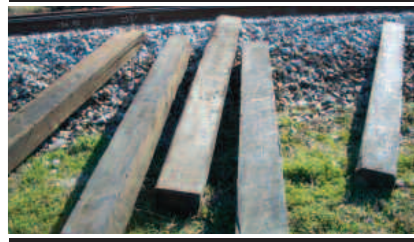
Research has proven that wood crossties pre-treated with borate, then over-treated with creosote, last longer in track, especially in the Southern United States.

Information@pacificwood.com • www.pacificwood.com